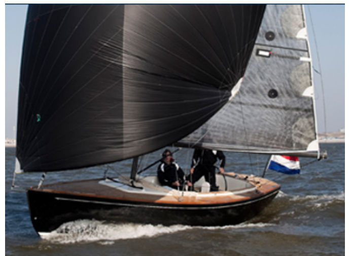
SAFFIER 26 DAYSAILER (2009)